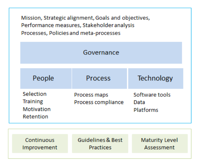
Fig. 1. COGAF Architecture

Governance is led by a governance body that is formed during the initiation phase of the graduate attributes assessment project. It may contain the stakeholders who will lead the project at both the department and faculty levels. The definition of stakeholders and their roles is discussed later in the paper.